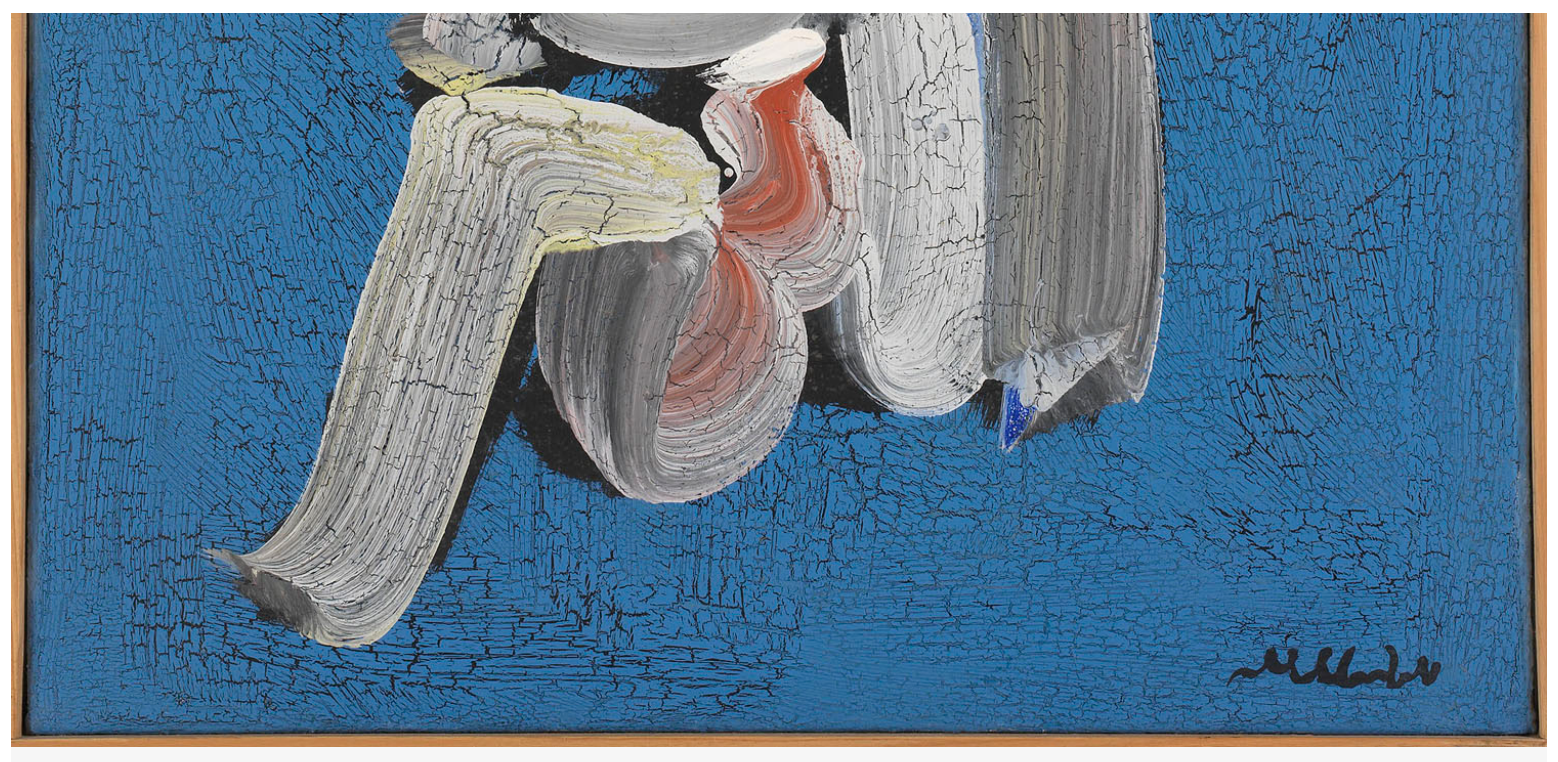
Hamed Abdalla, Al Tamazouq (Torn) (1975).