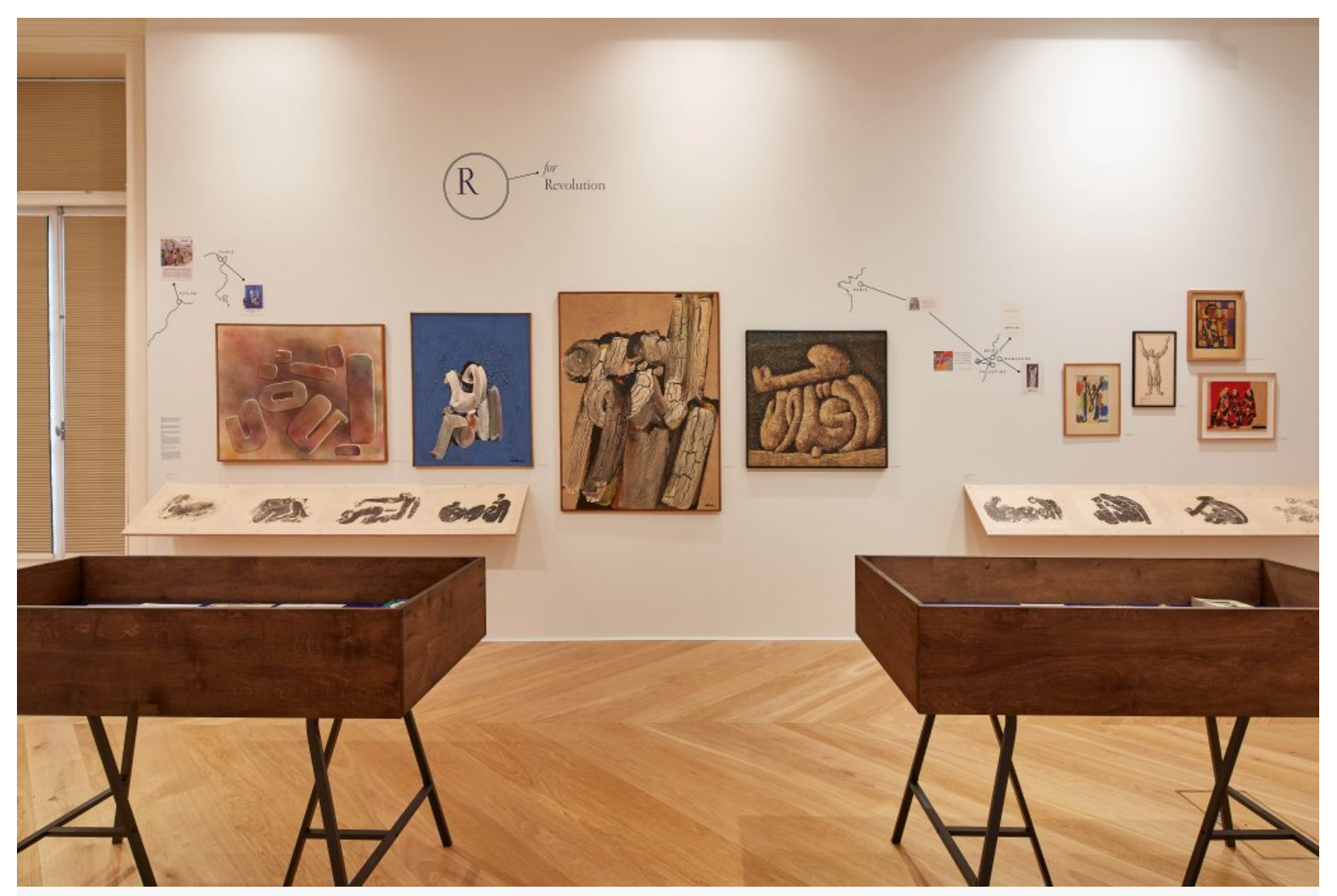
Installation view of "Hamed Abdalla: ARABÉCÉDAIRE" (until 23 June) at The Mosaic rooms.

Especially transgressive, given Islam's forbidding of figurative and sexual imagery, are the four monographs The Creative Word (erotic) (1961), in which couples assume Kama Sutra-like positions that also provocatively form the words for Zionism, dowry and defeat.